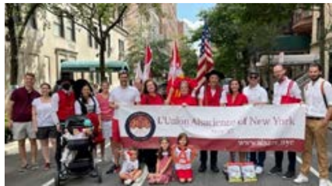
Steuben Parade - New York City - 2021

Due to COVID, the Steuben Parade (German Pride Parade) did not take place in 2020 and so it was with great excitement that 20 Union Alsacienne of New York members were able to participate this year! We joined together, with our coiffes, traditional dresses, flags and newly-created association banner to show our Alsace pride. We proceeded proudly amongst other groups from Austria and Switzerland and Germany as well as marching bands and other cultural, social and entertainment clubs. After the parade we gathered at Jacques Brasserie in upper Manhattan for a delicious lunch. We look forward to next year's participation and hope to see you there!