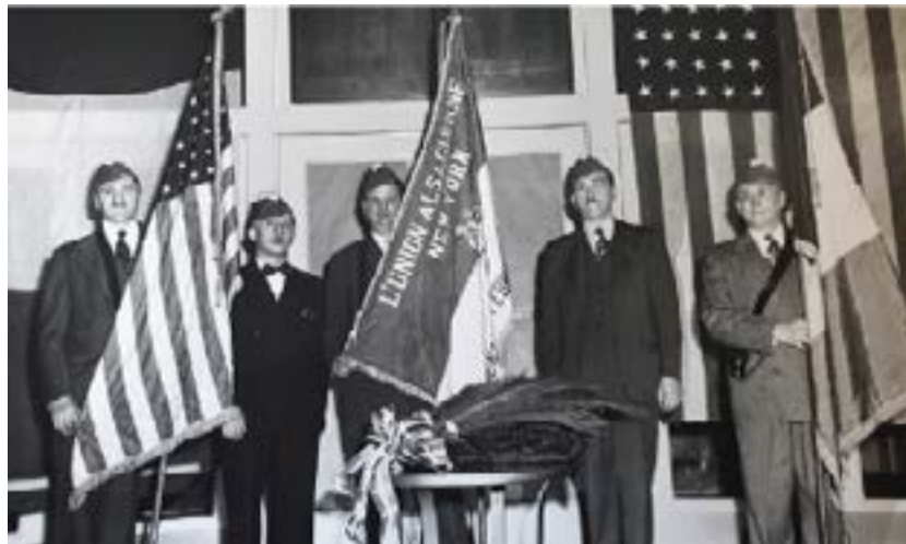
Le drapeau historique dans les photos d'archives.

The Alsatians , known to be hard working and industrious, have shown how creative and productive they can be, despite adversity ! That will only be possible if we have you as our companion and supporter in the journey ahead.