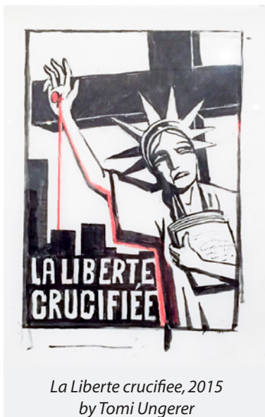
La Liberté crucifiée, 2015 by Tomi Ungerer

Regarding activities, 2015 began by honoring Tomi Ungerer, who left New York forty years ago. The Drawing Center honored the artist with an exhibition that opened on January 15. Two days earlier, L'Union Alsacienne organized a presentation on the artist