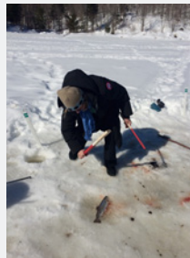
catching a trout!