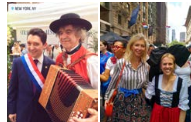
Olivier Cadic, Senator for French citizens living abroad

L'Union Alsacienne was very present on 14 July to celebrate Bastille Day 2019 at its traditional Street Fair on 60th street, from Fifth Avenue to Lexington Avenue.